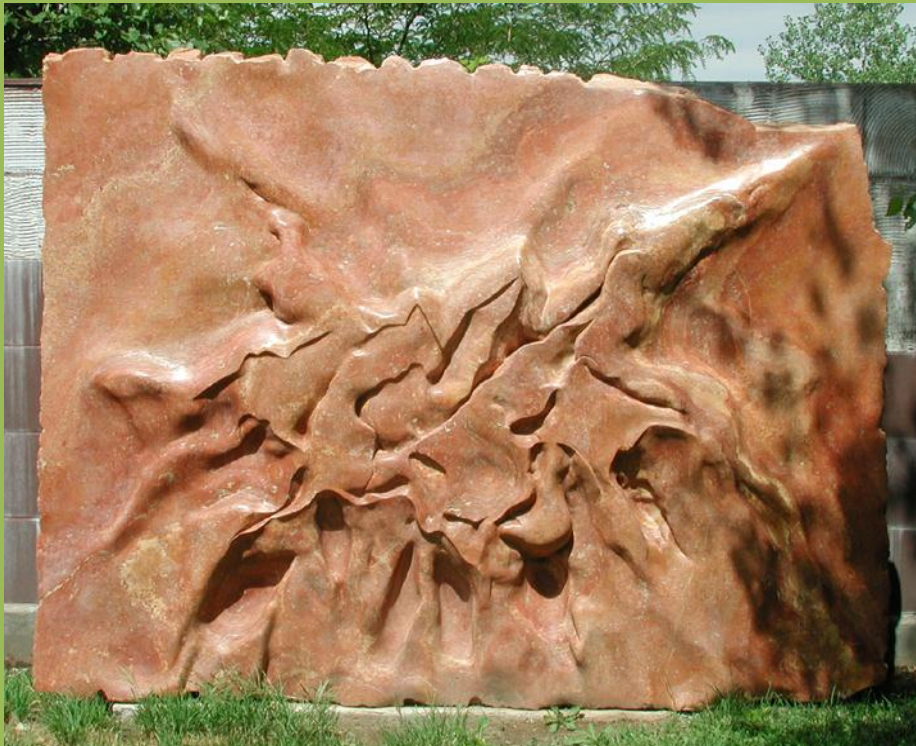
“La Blessure,” Lomas-Tramway Library