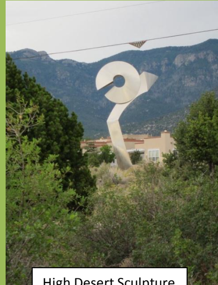
High Desert Sculpture

Academy Road. The road is named for nearby Albuquerque Academy, one of the City's most prominent private schools and the former owner of the Elena Gallegos Grant land. See the next entry, Mile 6.4. Near the northeast corner of this intersection is another large sculpture courtesy of High Desert.