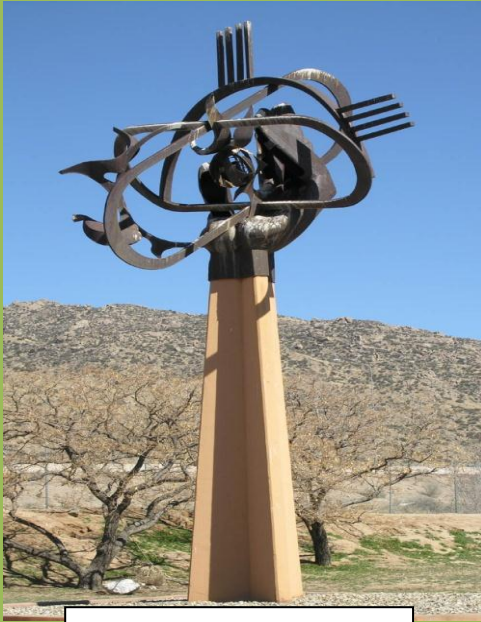
The Hand Of Friendship

In the southeast corner of Tramway and I-40 lies La Luz de Amistad City Park with its sculpture, The Hand Of Friendship. The first of many pieces of public art to be found along the Tramway corridor, the sculpture was dedicated in 1969, having been commissioned by a private individual and later adopted by the City Arts program. The Hand holds an eternal torch, encircled by symbols of atomic energy and the Zia sunburst. The eternal flame of the torch has since been extinguished due to cost concerns. Toward the north side of the park sits a more recent sculpture. The park also has several bicycle parking racks, themselves attractive objects plus a few automobile parking spaces.