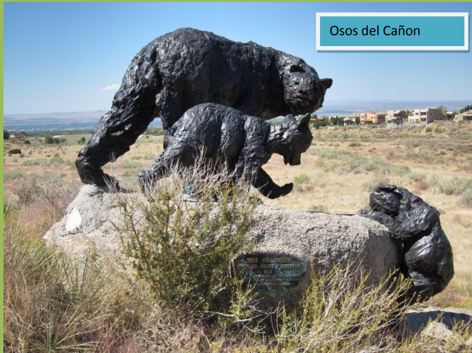
Osos del Cañon

network of bike lanes, and the Elena Gallegos Open Space area. Westward from Tramway, the drainage has been dammed and left lightly developed, enhancing both flood control and recreation. Arroyo del Oso Park and Arroyo del Oso Golf Course are examples of such multi-use planning. The Arroyo has a series of bike paths