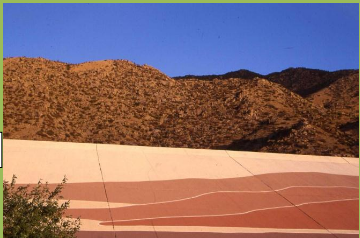
"Morning Allegory", Piedra Lisa Park

Menaul Boulevard. Eastward, Menaul climbs through the foothills development. At .3 miles is Piedra Lisa City Park, an attractive facility with picnic tables and shade. At the east end of the park, adjacent to City Open Space, note the huge and colorful depiction of the Sandias painted on the concrete spillway for the flood control dam. More public art sits at the park's entrance. At .6 miles, Menaul ends at parking for City Open Space.